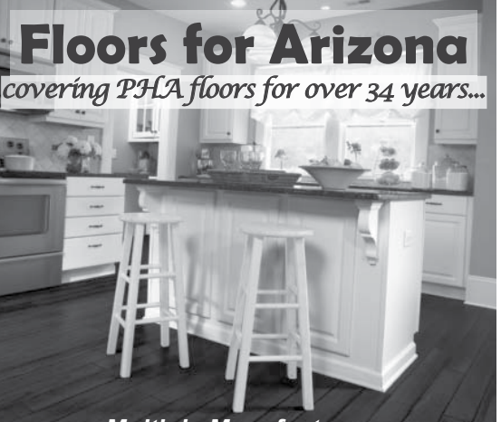
Multiple Manufacturers Complete Installation / Materials Only