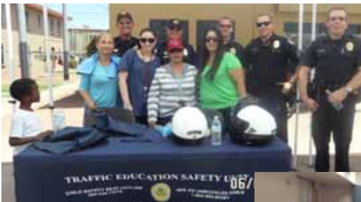
City of Phoenix Community and Supportive Services staff, and City of Phoenix Police Officers at the 2015 Father's Day event at Sidney P. Osborn.

The eLogic Model is a tool that integrates program operations and program accountability and aide grantees with managing, monitoring and evaluating program services. This session will help attendees understand the eLogic Model tool, discuss how to count the service activities and outcomes that are measured in units of persons/household, and how the tool is used to meet performance and reporting requirements for the HUD Family Self-Sufficiency and Service Coordinator Grants.