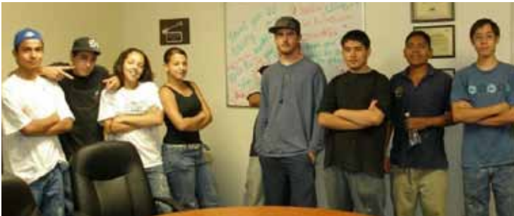
City of Flagstaff frequently partners with the Coconino County Career Center to help local teens gain job skills.