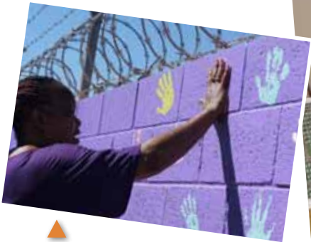
Phoenix residents at Marcos de Niza put their handprints on a purple wall to signify their support of the city's Paint Phoenix Purple campaign.

The audience will be called upon to talk about their experiences, share their stories and develop a top ten list of the most important elements of a relocation program.