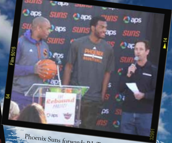
Phoenix Suns forwards P.J. Tucker and T.J. Warren attended the court dedication at Sidney P. Osborn - a renovation made possible through The Rebound Project, a partnership between APS and The Phoenix Suns.

Having a little fun at the 2014 AZNAHRO Conference